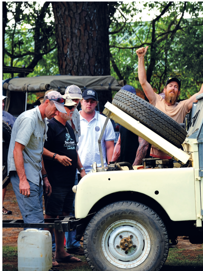
Above and below There's always a little preventative maintenance to be done in the morning. And to be fair, any vintage vehicles on a trip like this would need similar care. (No, it's not just a Landy thing!)